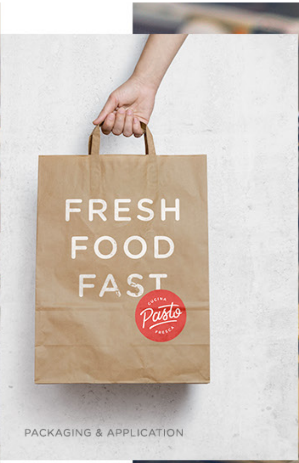
PACKAGING & APPLICATION