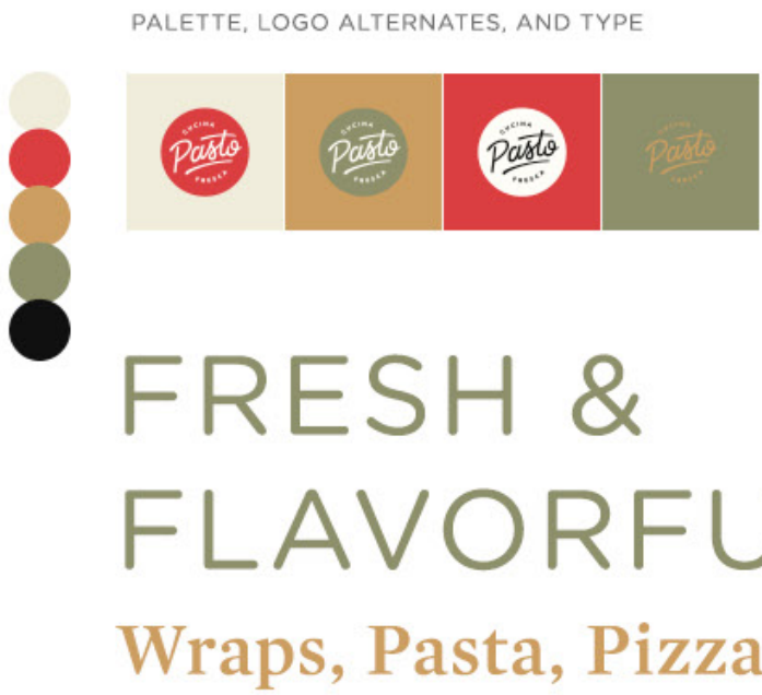
PALETTE, LOGO ALTERNATES, AND TYPE