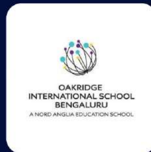
Oakridge International Bengaluru