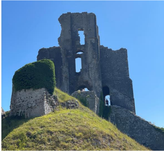
Visit to Corfe Castle