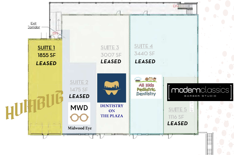
UPPER LEVEL SPACE PLAN

From two different front facades to ample patio space to a diverse mix of uses, Plaza Hill aims to serve these urban communities, each in their own unique ways.