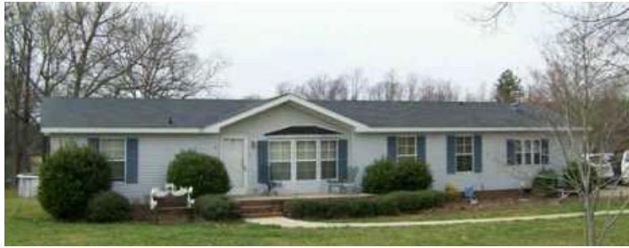
1,784 SF MANUFACTURED HOME

NOTE: BOUNDARY INFORMATION PREDICATED FROM INFORMATION IN DEED BOOK 1434, PAGE 644 AND MAP BOOK 9995, PAGE 10193.