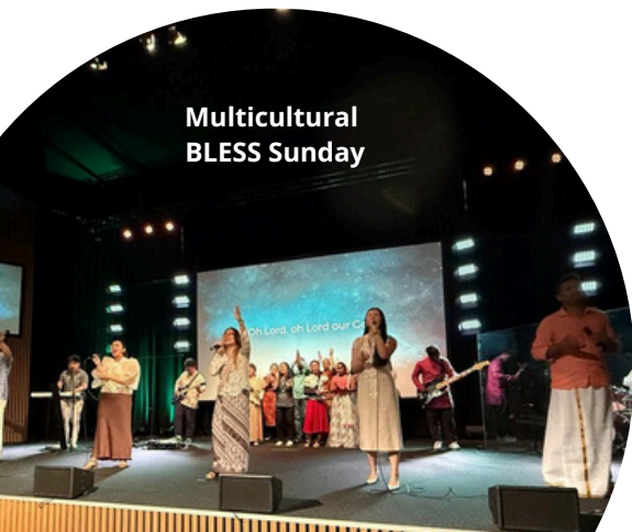
Multicultural BLESS Sunday