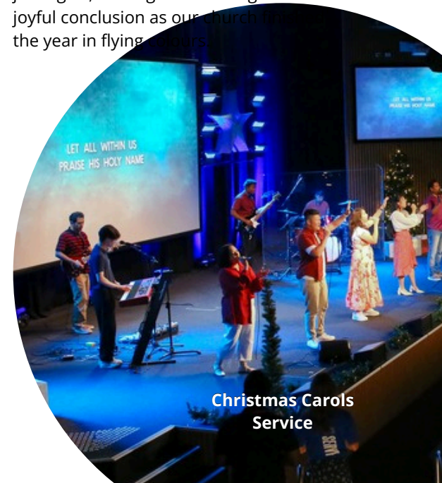
Christmas Carols Service

We ended the year on a high note with our Christmas Carols Services , celebrating the joy and hope of Christ's birth. The services were filled with uplifting carols, a warm and welcoming atmosphere, and many BLESS friends joining us, making it a meaningful and joyful conclusion as our church reflected the year in flying carols.