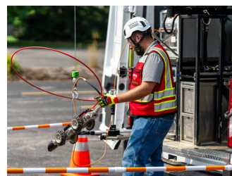
Video Pipe Inspection