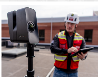
Reality Capture & CADD/BIM

WE'RE THE ONLY SCALED PLAYER FOR RETAIL AS-BUILT SOLUTIONS