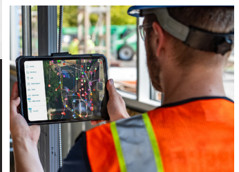
SiteMap GIS Platform