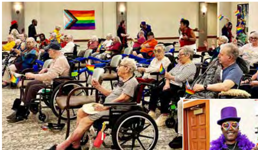
Pride Parade with Elders and Care Partners

Shalom Park was filled with color, music, and joy during our festive Pride Celebration! Elders, Care Partners, family members, and volunteers came together for our very own Pride Parade, celebrating love, identity, and inclusion. Pride is deeply important at Shalom Park, and this joyful event reflected our commitment to honoring the diversity and dignity of every person in our community. ●