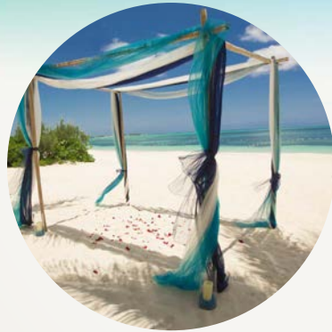
2. West Beach