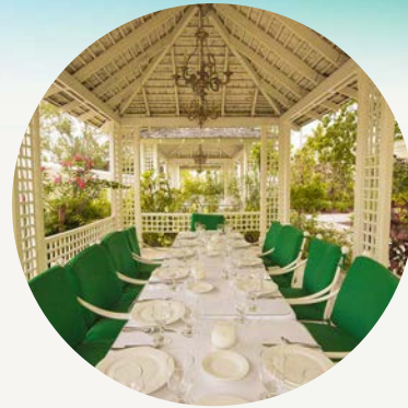
3. Garden of Eden