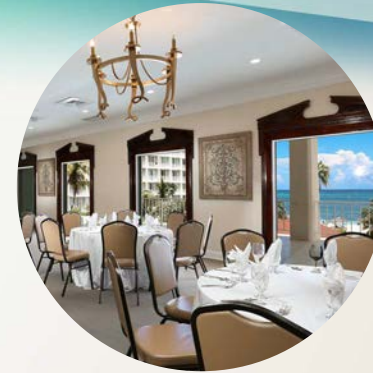
4. Ball Rooms (conference rooms)