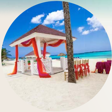
1. Beach Gazebo