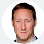
The Hon. Peter MacKay

Deputy Director Directorate of Defense Government of the Grand-Duchy of Luxembourg