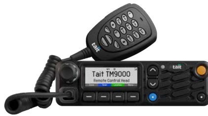
TCH4 Remote mount with built-in 4W speaker and single or dual head options