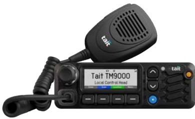
TCH3 Local dash mount with built-in 4W speaker