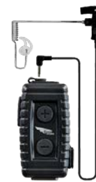
Nighthawk Bluetooth Mic