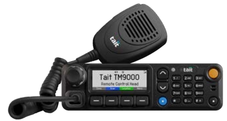
TCH6 Remote mount with built-in keypad and single or dual head options