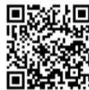
Scan for iPhone