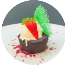
CHOCOLATE FONDANT 7 MOLTEN-CENTERED CHOCOLATE CAKE WITH PISTACHIO CRUMBLE AND VANILLA ICE CREAM.