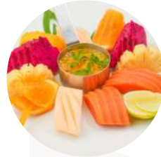
SEASONAL FRUIT PLATTER 3 FRESH-CUT SEASONAL FRUIT GARNISHED WITH LIME AND MINT.