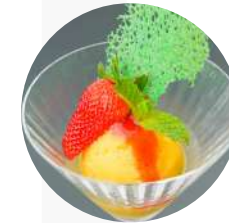
PASSION FRUIT 5