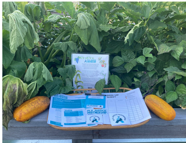
We're very excited for the new subscribers who signed up for our mailing list at Fairy Night at the Community Garden!

Please also donate what you can to relief organizations still working on the ground in Palestine to fight famine. World Central Kitchen is one, and they can be found at https://wck.org/donate .