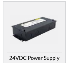
24VDC Power Supply