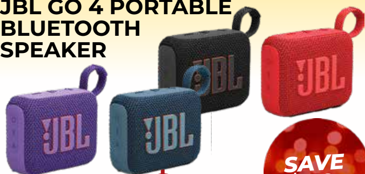
JBL GO 4 PORTABLE BLUETOOTH SPEAKER