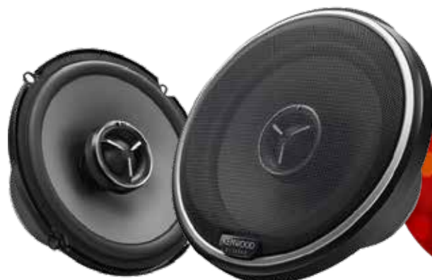
KENWOOD 6.5" Coaxial Speaker