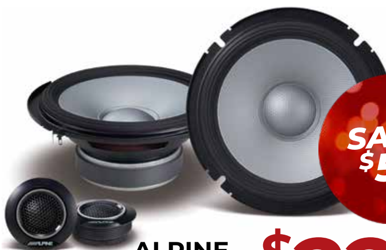
ALPINE 6.5" S-Series Component Speaker System