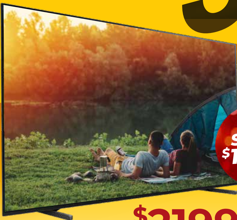
SONY BRAVIA 8 OLED GOOGLE TV

BACK TO SCHOOL? FALL? NAH. WE'RE SO NOT THERE YET.