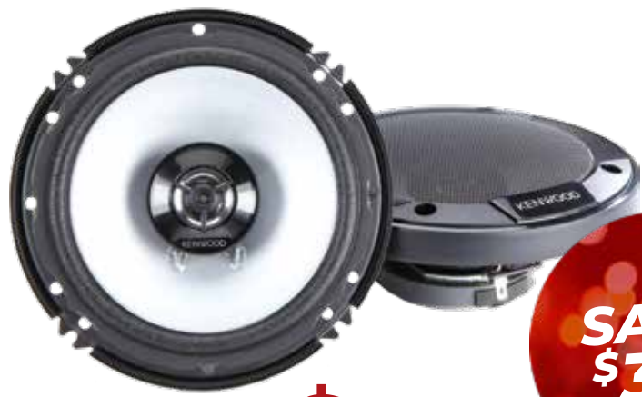
KENWOOD 6.5" Coaxial Speaker