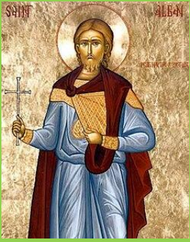
St Alban, Martyr