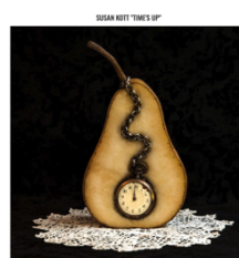
Award Winners from PMPE 2025