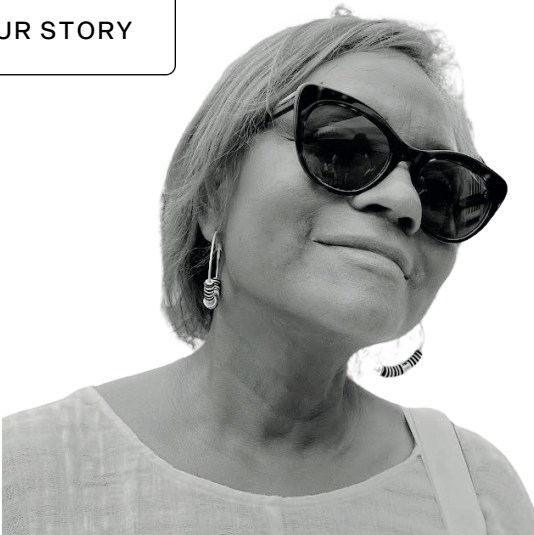
Chief Prosperity Officer, CFO