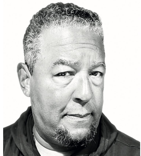
Chief Prosperity Officer, CFO