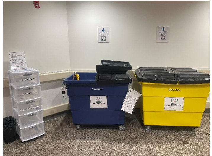
AVENS Spin drop off and pick area, located on the lower level of the Aven Pavilion

If you want to know more about AVENS Spin or any of our other aging in place services, please don't hesitate to reach out. We're here to help make life a little easier and a lot more enjoyable for our wonderful seniors' community!