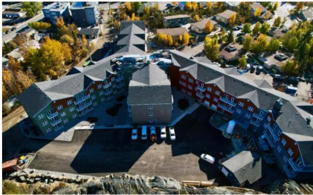
A photo published by Avens shows the Aven Pavilion facility.

Ollie Williams - Tuesday January 13, 2026 at 12:31pm MT