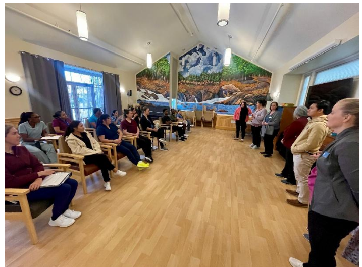
Our AVENS Management Team being introduced to Aurora College first year LPN students on Thursday, January 22, 2026

Together, we are shaping the future of care, one step at a time.