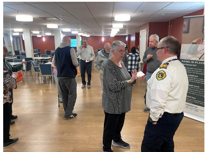
The Fire Chief stayed behind with both sessions to mix and mingle with Pavilion tenants for more one-on-one conversations. Treats were compliment of our AVENS Food Services Team