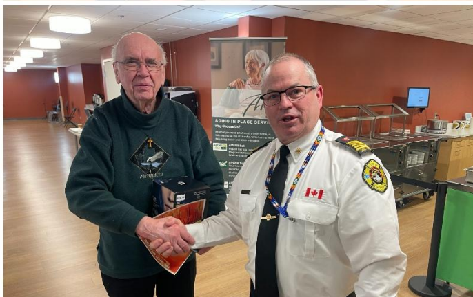
A couple of lucky door prize winners. Thank you again to Shoppers Drug Mart