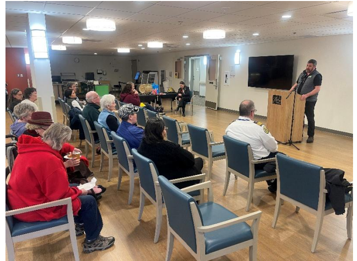
An overview of the crowd of attendees of both sessions, over 32 tenants participated