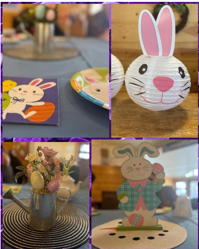
Easter decore can be found throughout campus