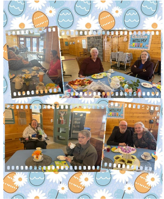
Many residents enjoying Easter Tea

Wishing you all a wonderful Easter filled with love, laughter, and maybe a little chocolate too!