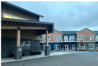
Aven Pavilion in October 2025.