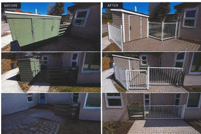
This is very simple AI version (Not to scale or colour) of what the completed patio should look like from before (left side) and after (right side)