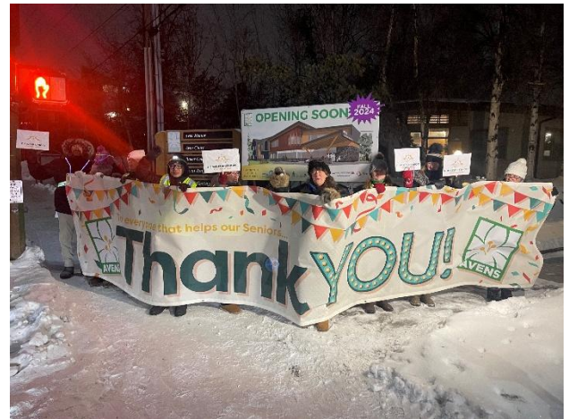
Who can ever forget our winter “The Wave” community launch of the fundraising event in 2024?

On July 7, 2026, I felt a sense of pride. As on this day we marked the successful closure of our "Homes for Seniors – Choice Matters!" fundraising initiative, and I couldn't wait to share the news with everyone who had played a part in this incredible journey.