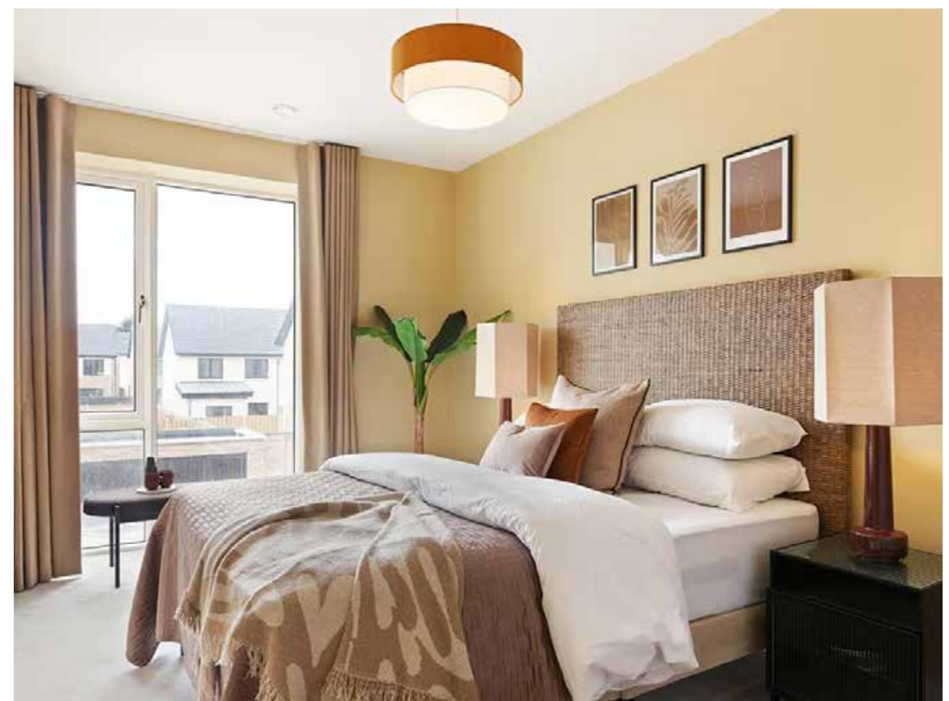
Note: These interiors are from Ashcourt at Woodbrook and are for reference only