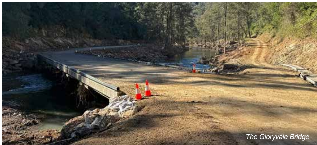
The Gloryvale Bridge

Please note the OXLEY HWY, 80km EAST of Walcha (between Gingers Creek and Forbes River Road) is still under weekly scheduled closures due to ongoing roadworks.