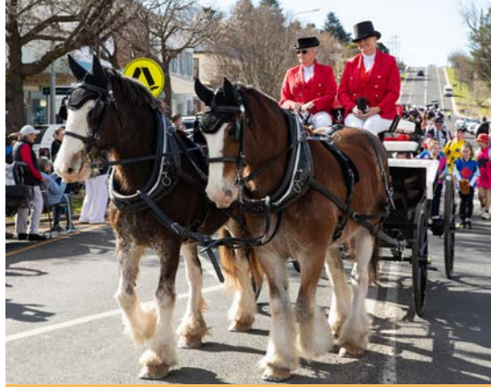
Hunter Valley Classic Carriages leading The Cup parade.