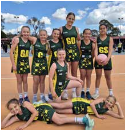
Pictured above: Award winners for 2025. Left: Walcha Opals, third in Division 1. Inset below: Division 1 runners-up, Walcha Diamonds.