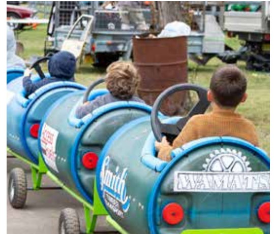
Left: Just one of the local trucks on display at WAMATS. Right: A 'road-train' of children enjoyed being towed around the showground. Below: The Showground was a hive of activity for WAMATS weekend.

Last weekend, Walcha was abuzz with excitement as it hosted the Walcha Antique Machinery and Truck Show (WAMATS). The three-day event was a tremendous success, drawing in more than 250 exhibitors and over 1,000 attendees from the public.