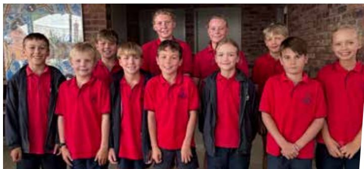
Above: Students that will be representing St Patrick's Primary at the Armadale Catholic Schools Swimming Carnival in Inverell on 27 February.