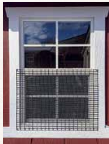
Wire Over Windows