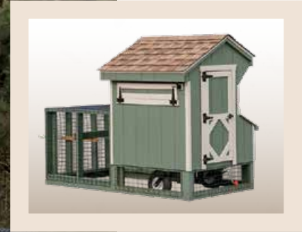
3' X 4' Quaker Tractor Light Green with Tan Trim Shakewood Shingles 75" High Outside 51" High Inside 13" Off Ground