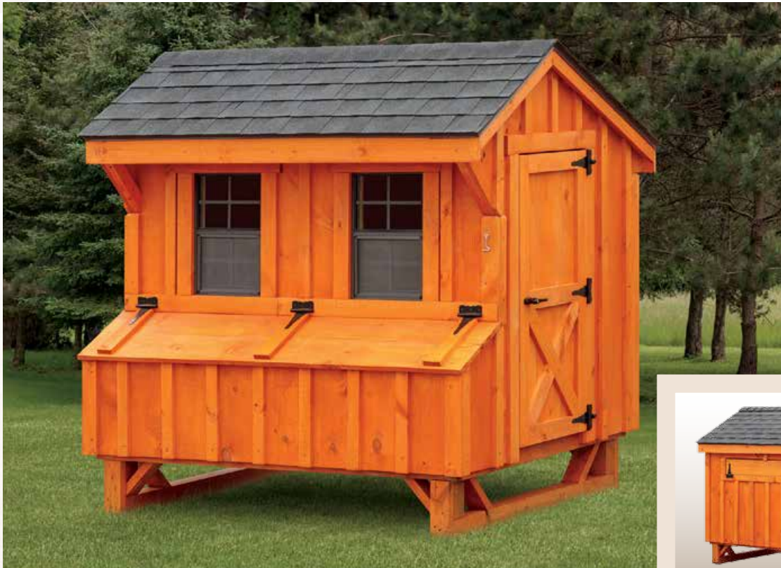
4' X 6' Low Wall Quaker Cedar Stain Charcoal Shingles Pine Board & Batten 80" High Outside 58½" High Inside 10" Off Ground