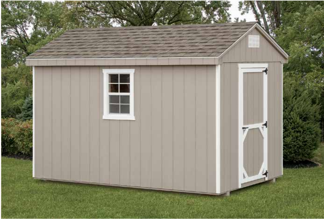
Feed Room View of 8' x 12' A-frame