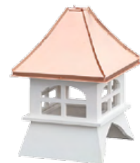
Window / Copper Top