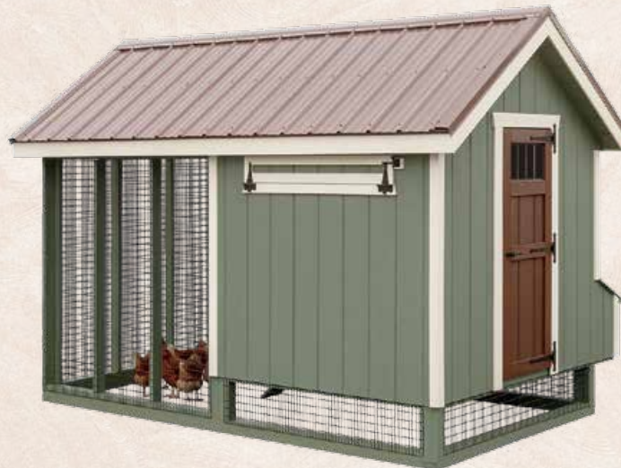
7' X 12' Classic A-Frame 6' House Light Green with Navajo White Trim Brown Metal Roof 112" High Outside 86" High Inside