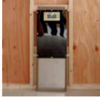
Auto Chicken Door