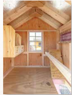
4' X 4' Classic A-Frame Pink with White Trim • Charcoal Shingles 86½" High Outside • 54" High Inside 22" Off Ground