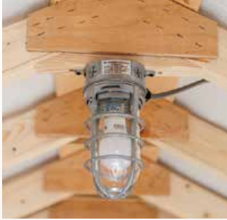
Electrical Package – vapor proof light, switch, outlet