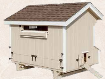
5' X 8' Classic Quaker Tan with White Trim • Barkwood Shingles 90½" High Outside • 69" High Inside • 10" Off Ground

Shown with Brown Door, Optional Transom Window and Clean-out Lids