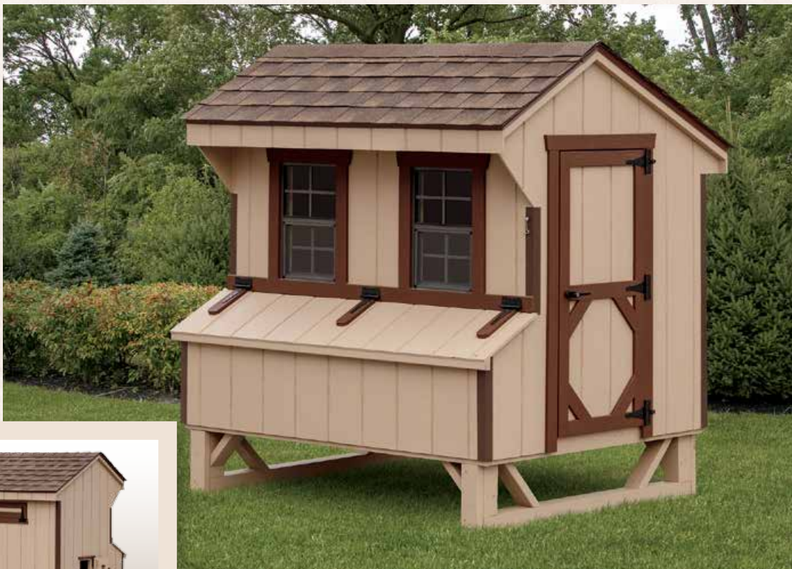
4' X 6' Low Wall Quaker Buckskin with Dark Brown Trim Barkwood Shingles 80" High Outside 58½" High Inside 10" Off Ground