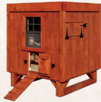
4' X 4' Green Coop Country Cedar Stain • Rubber Roof • TI-II Siding 69½" High Outside • 39" High Inside • 10" Off Ground