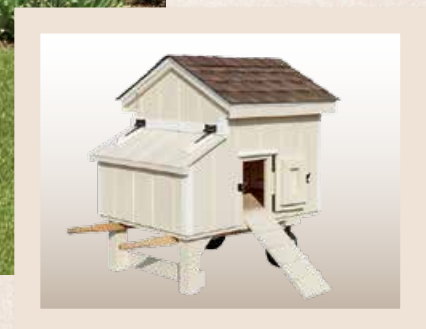
3' X 3' A-Frame Almond with White Trim Barkwood Shingles 57½" High Outside 33" High Inside 10" Off Ground Shown with Optional Wheels and Wheel Barrow Handle