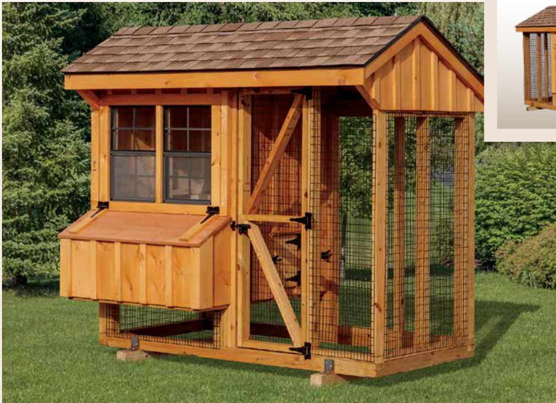
4' X 8' Quaker Combination Natural Stain Shakewood Shingles Pine Board & Batten 90" High Outside 65½" High Inside 14" Off Ground