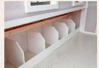
Poly Nest Boxes