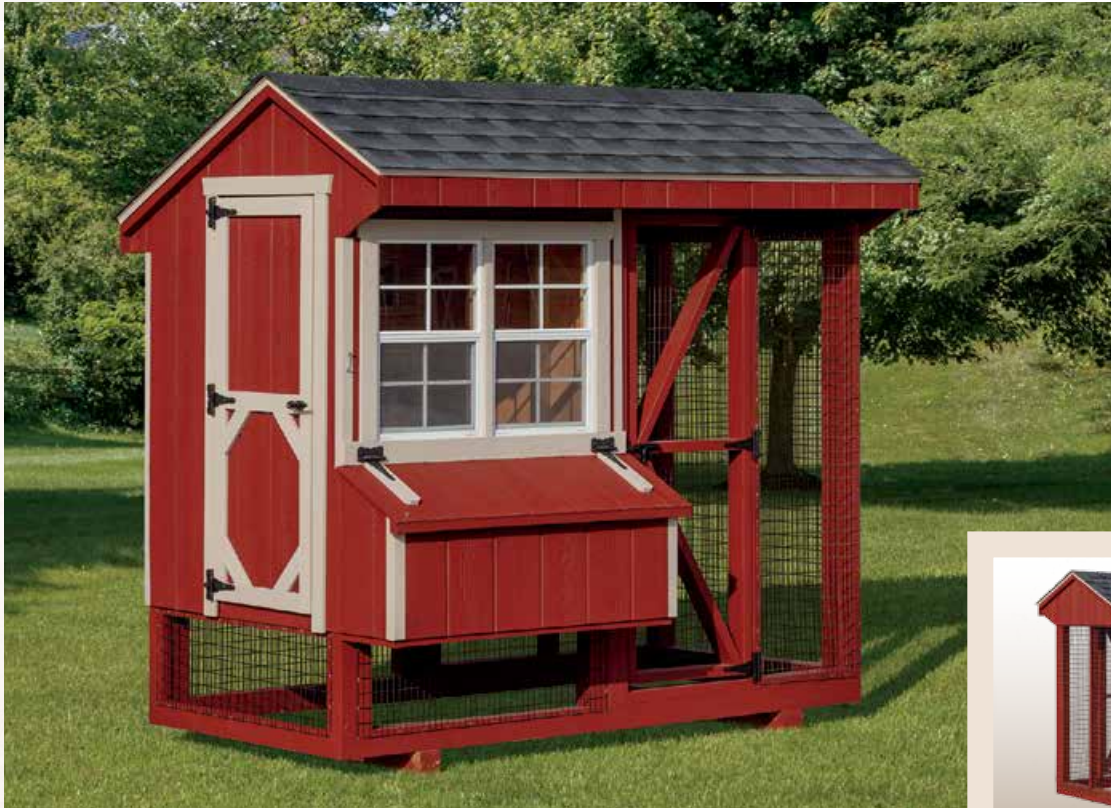
4' X 8' Quaker Combination Red with Tan Trim Charcoal Shingles 90" High Outside 65½" High Inside 14" Off Ground