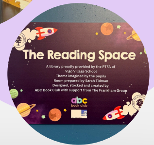
The Reading Space