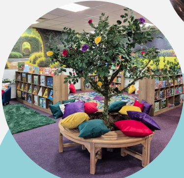
Heathfield Primary School Croydon