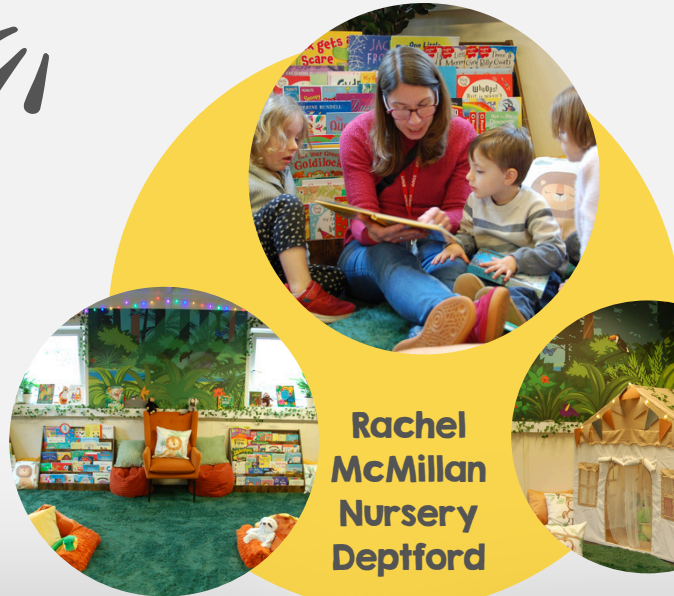
Rachel McMillan Nursery Deptford