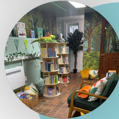
Plumcroft Primary School Plumstead