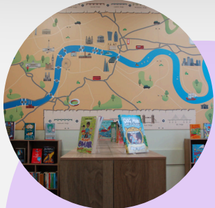
Howard Primary School - Croydon

It's been a busy quarter for ABC. With 5 library launches, a BookFest for schools fundraising challenge, and ABC's very first Gala Dinner all taking place in the first 3 months of 2026