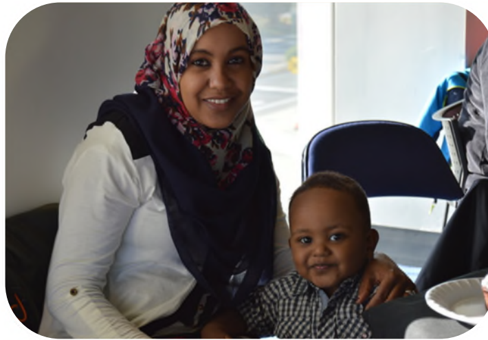
Compensation for Parental Caregivers