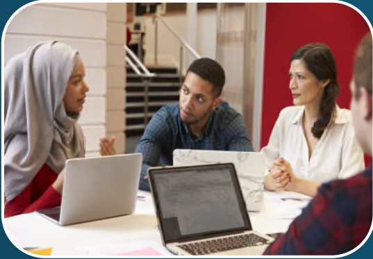
Language Access: Change in Action