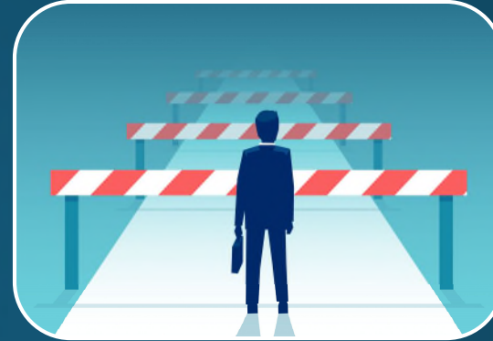
Challenges & Obstacles