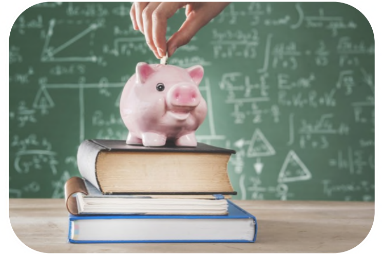
Eliminating the Special Education Enrollment Cap