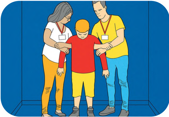
Restraint and Isolation