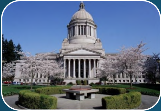
2024 Legislative Priorities