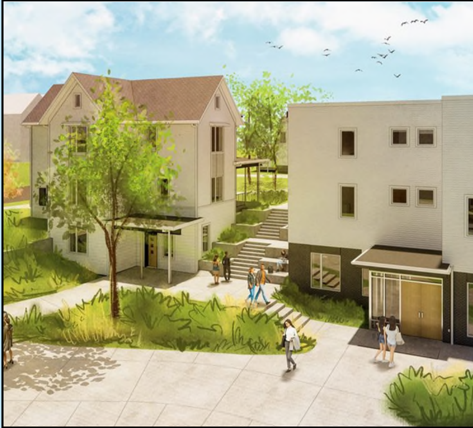
$5 million for Multicultural Village