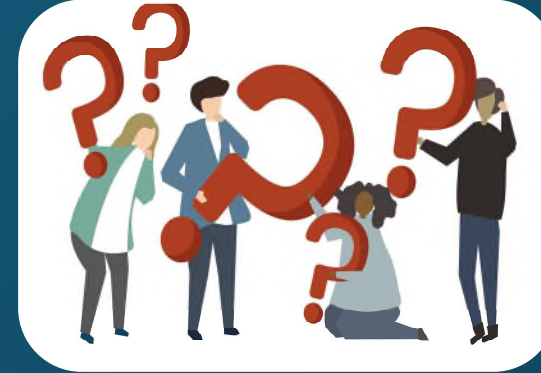
Our Next Steps