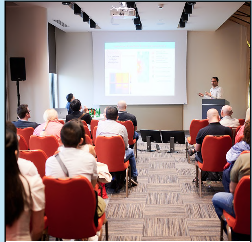
$250,000 for Intersectional DD Conference