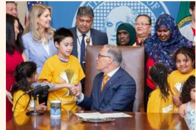
Advocate for Systems Change