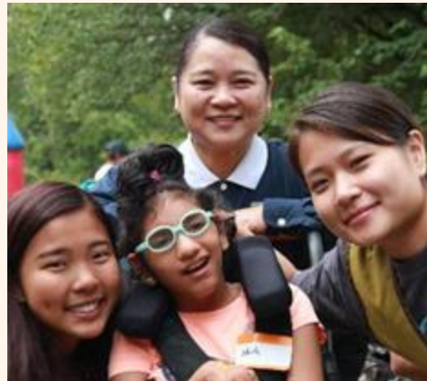
Provide specialized programming