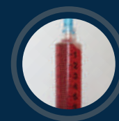
CELLS, PLATELETS & GROWTH FACTORS READY FOR USE