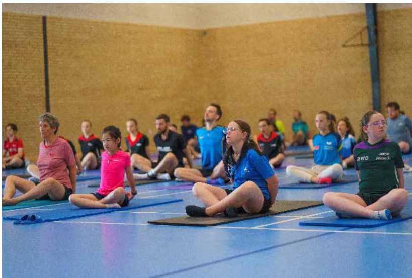
Yoga every morning.