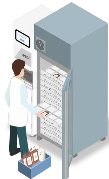
User putting RBC products into the Smart Access Kit