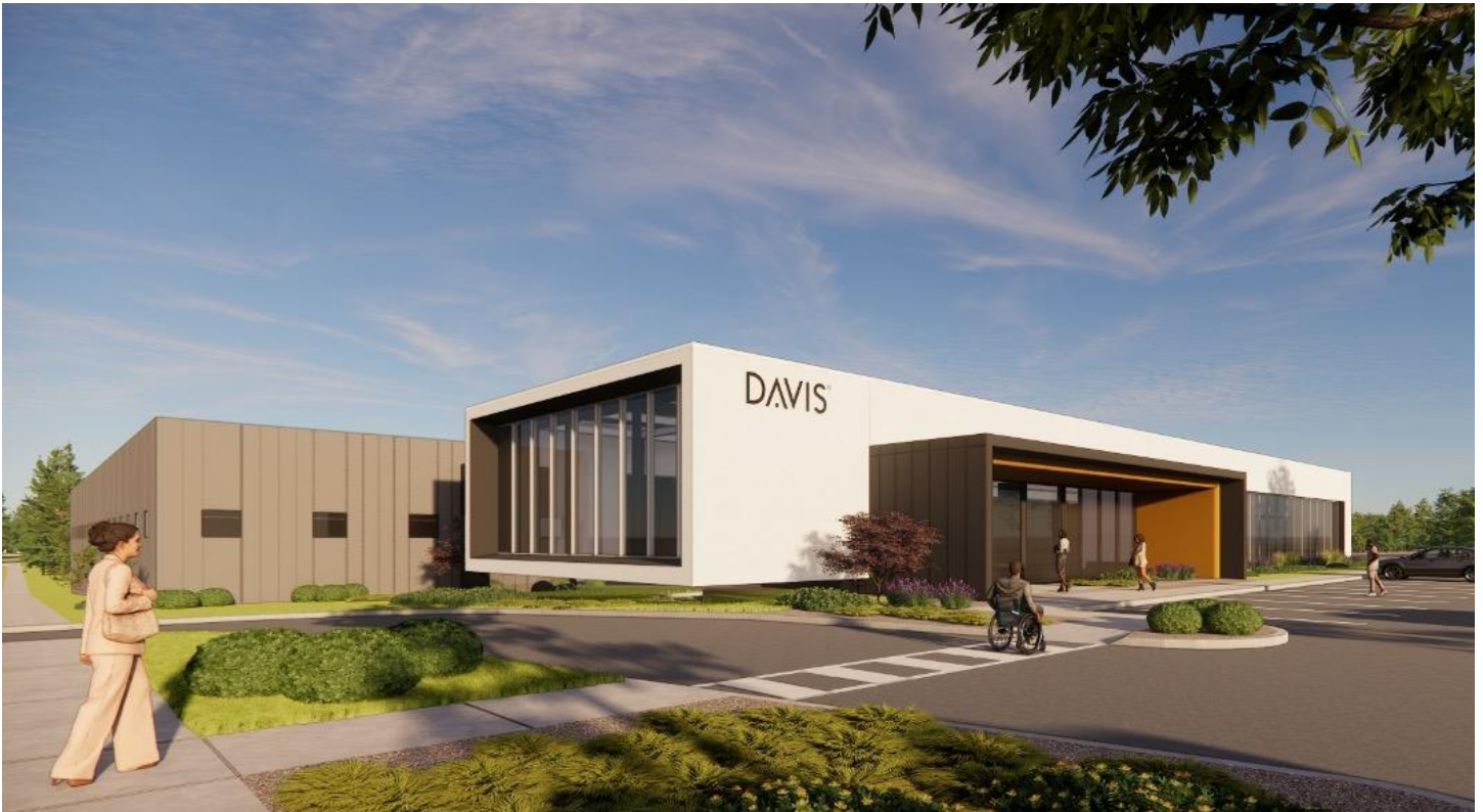
Renderings of New Manufacturing Facility, Sales + Marketing Office, and High Point Showroom. Designed by Stitch Design Shop.