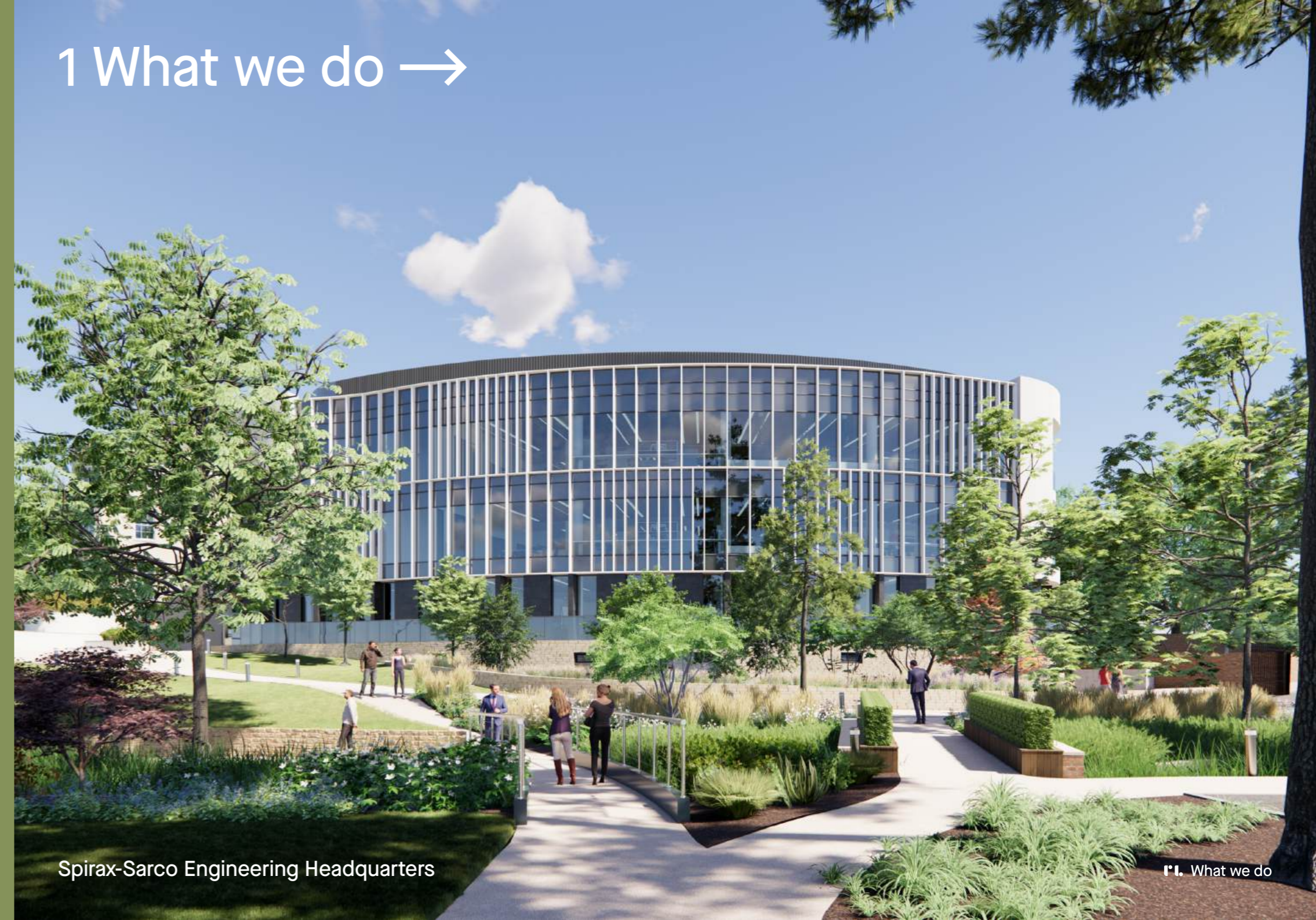
Spirax-Sarco Engineering Headquarters