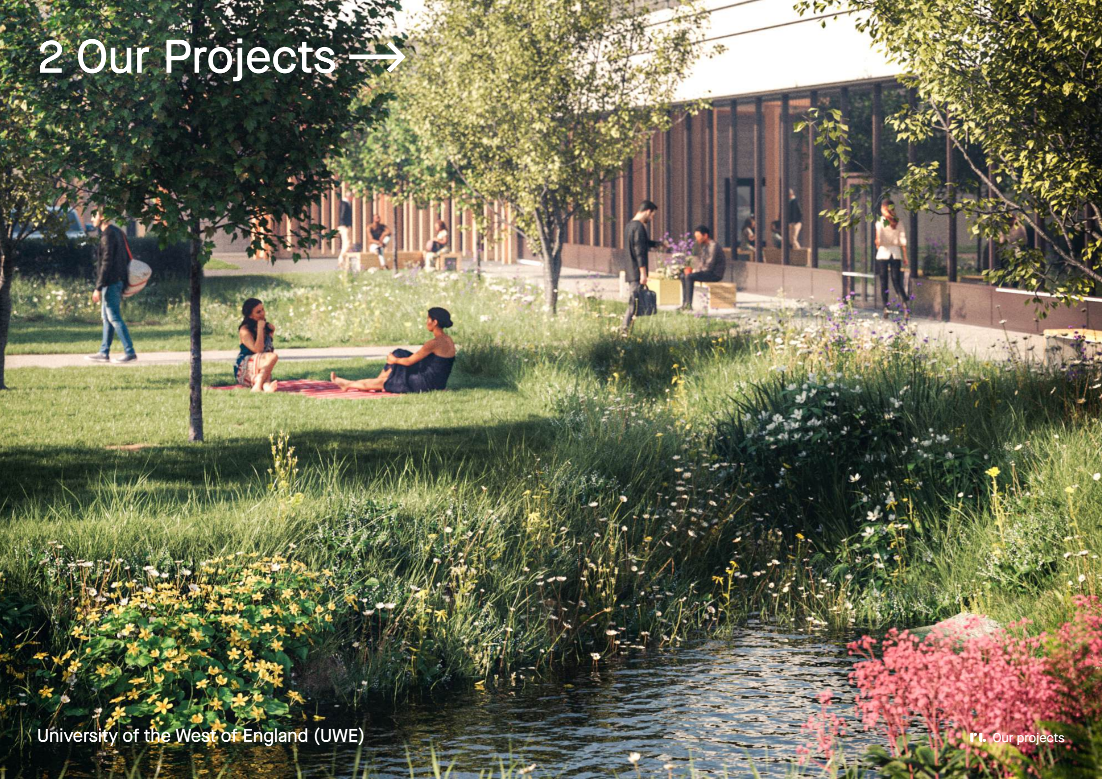
University of the West of England (UWE)