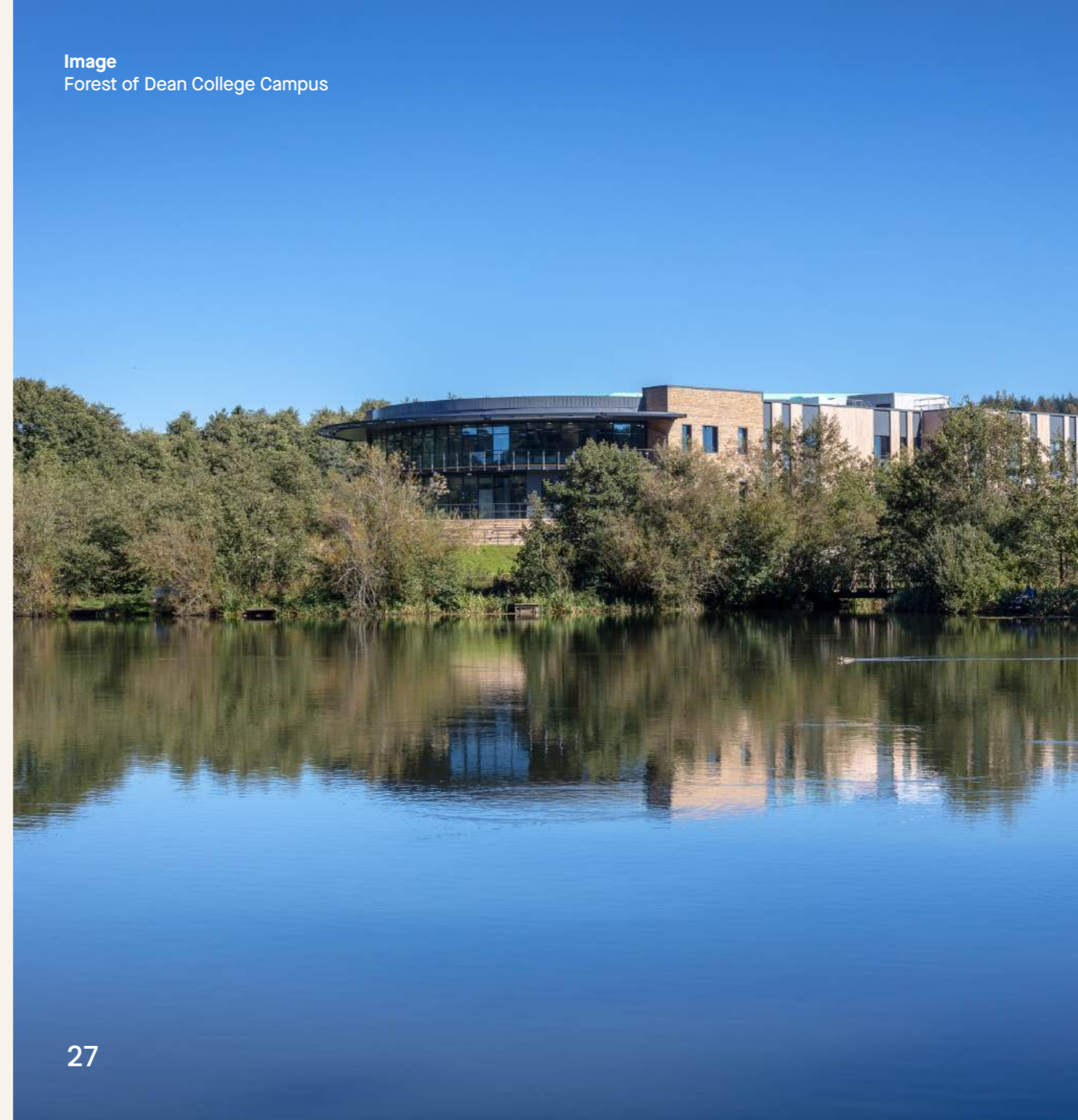
Image Forest of Dean College Campus

Our designs look at ways to enhance pedestrian movements as well as add greenery to the street, incorporate rain gardens for sustainable urban drainage, and provide spill-out spaces with seating. This will animate the street and encourage people to spend more time there.