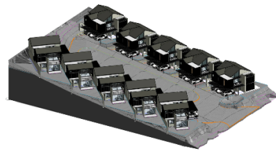
North West 3D view