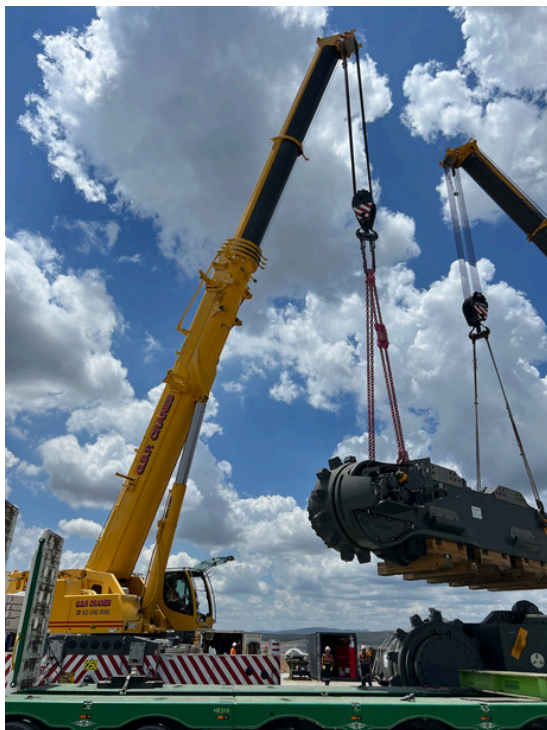
Dean-0 Sling assisting in lifting an undercarriage of an excavator

A specialty designed sling produced by Andromeda Industries.