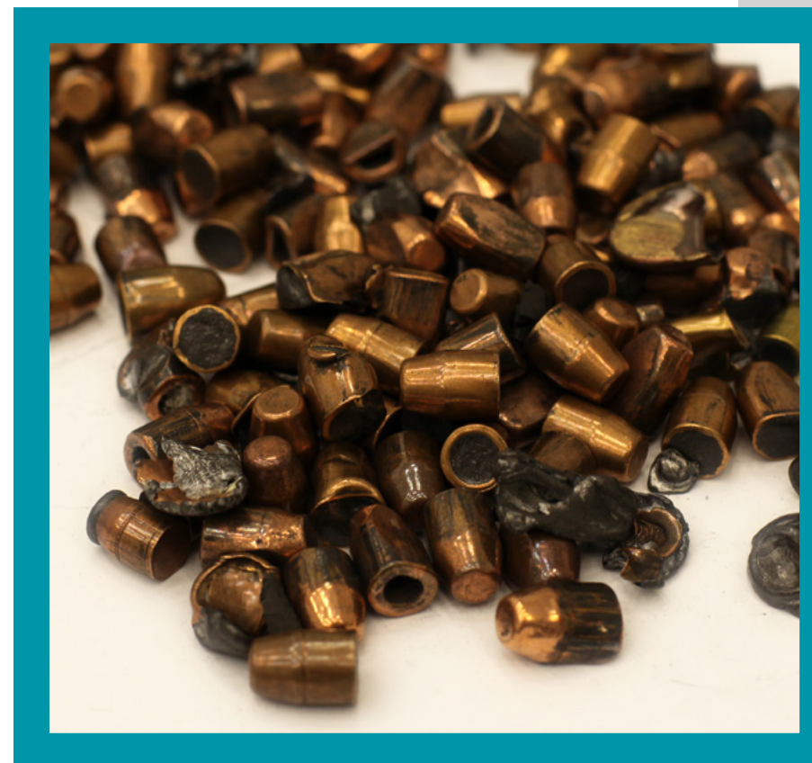
GranTrap bullet fragments

The GranTrap™ rubber bullet trap's patented stair-step design uses unique GranTex™ granulate rubber material to stop incoming rounds mostly intact. That action minimizes airborne lead dust, averts back splatter, avoids ricochets and reduces impact noise. Plus, the GranTrap's rugged design stands up to busy ranges.