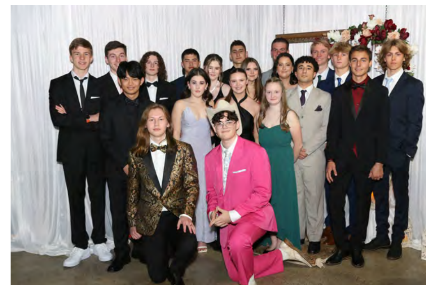
Old Packhouse Market - 2023