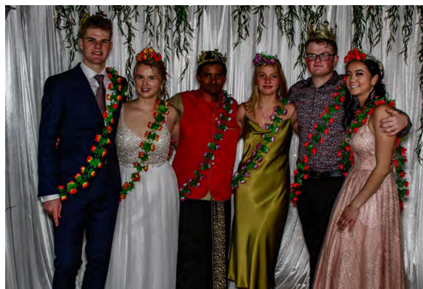
Year 13 of 2019