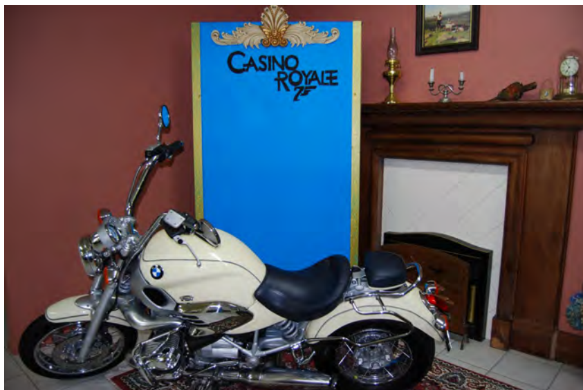
Casino Royale - 2007

As we approach the 2026 Senior School Ball, let's take a look back at some of the Senior Balls from over the years.