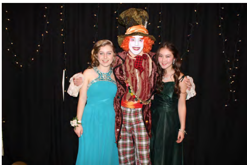
Alice in Wonderland - 2014