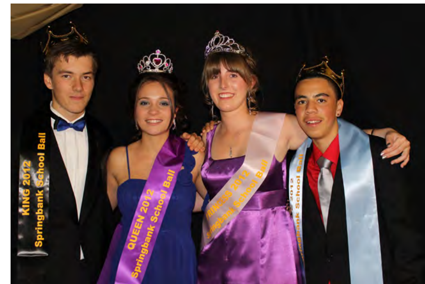
King, Queen, Prince & Princess - 2012