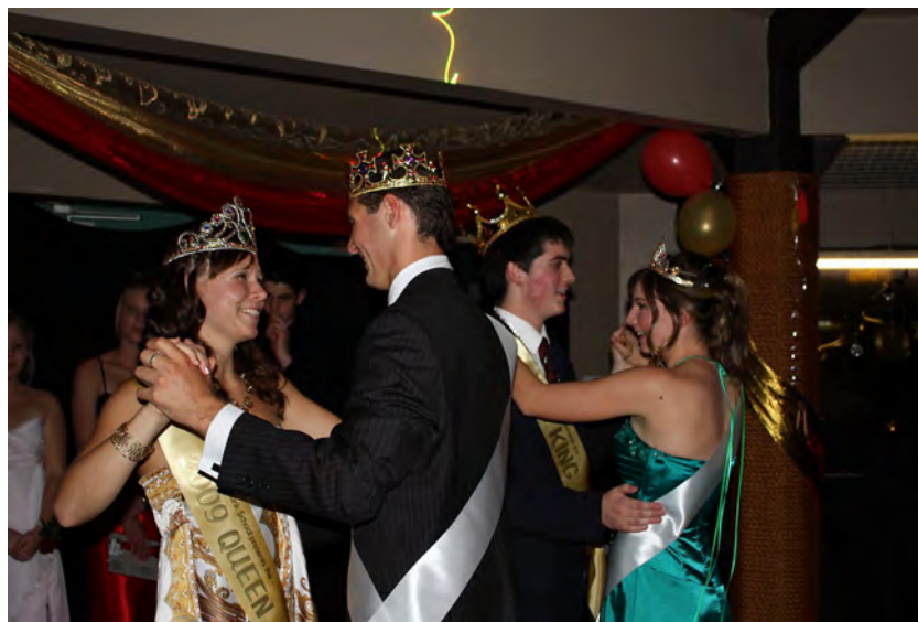
Formal Dance - 2009