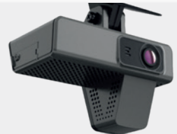
Driver facing camera