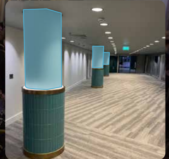
Wembley Stadium pillars