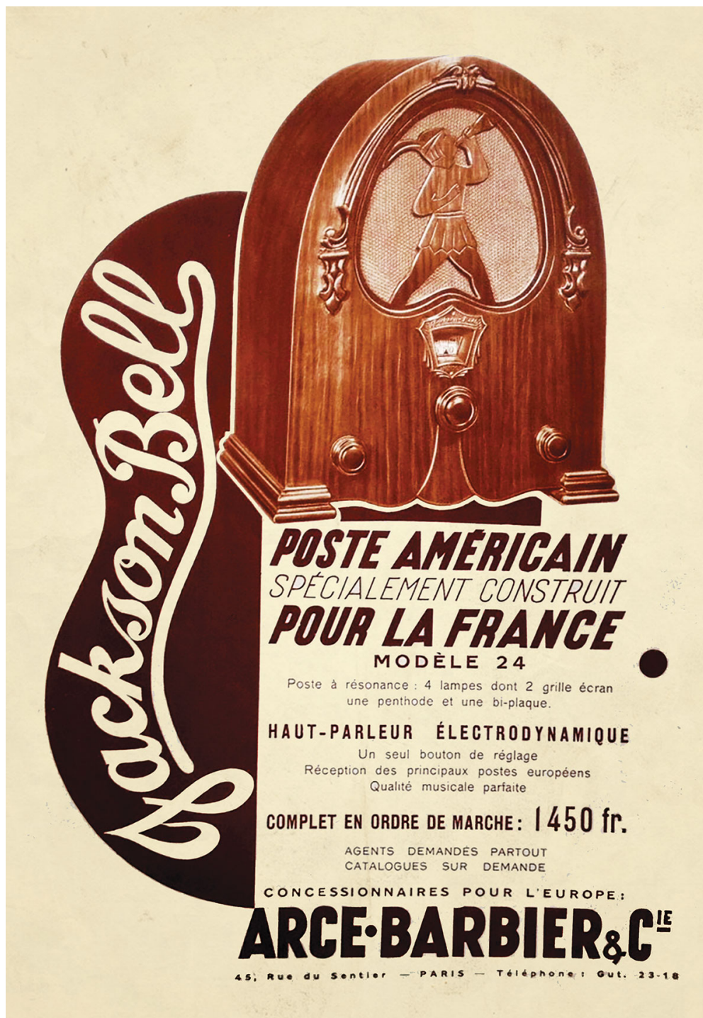
Color enhanced image of a French poster featuring the Model 84 Peter Pan - incorrectly identified as a Model 24

American Post Specially built for France Complete in working order 1450 fr. Agents requests everywhere Catalogs on Request