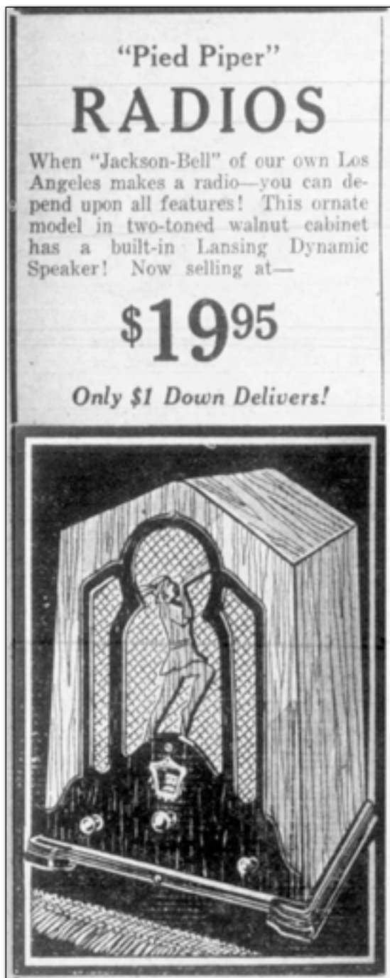
Jackson-Bell Model 4 (with drawer)

These Jackson-Bell radios were introduced in 1932. Advertisements presented here include some that were placed toward the end of that year for the 1933 market. Jackson-Bell went into receivership on December 2nd, 1932. Some of the latter variety were available in 1932.