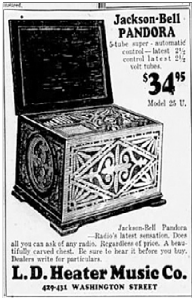
Jackson-Bell Model 25U Pandora

Cache American - Logan Utah 12/06/1932 - Page 7