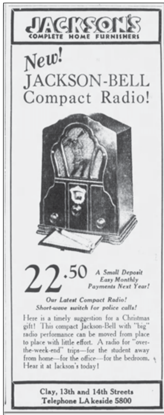
Jackson-Bell Model 24B

The Daily News - Los Angeles, Ca. 09/21/1932