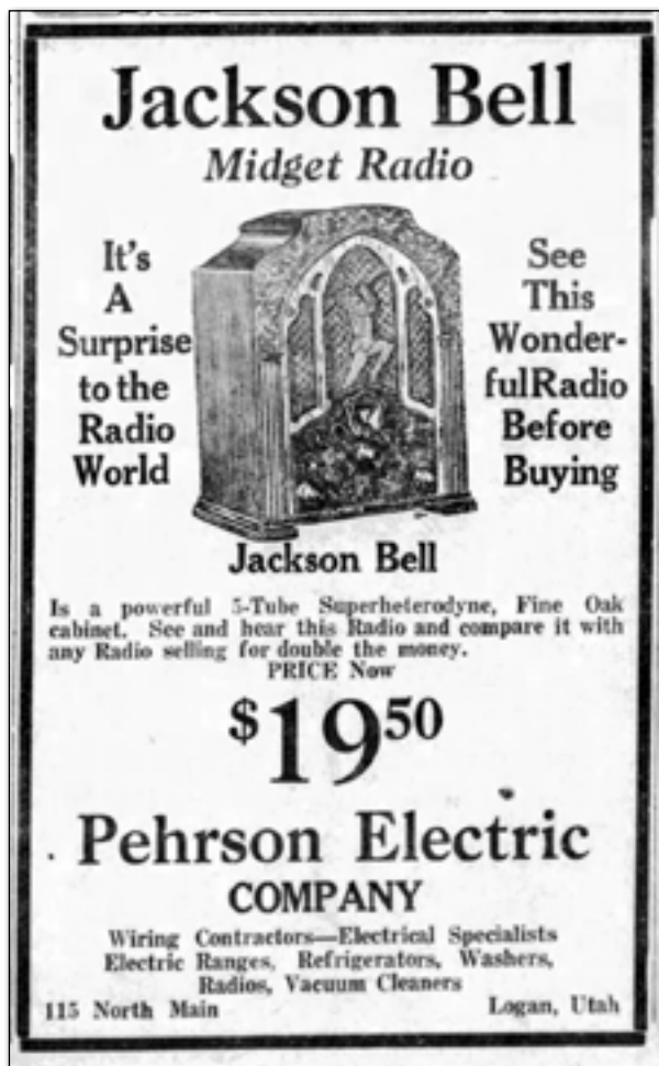
Jackson-Bell Model 25

Cache American - Logan Utah 12/06/1932 - Page 7