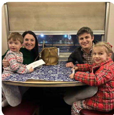
The Birkenhauer family enjoying their night on the train!