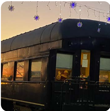
Santa giving us a goodbye wave!

At Lockshield Partners, we believe in supporting organizations who make the communities we live in a special place to live. The Historic L&N Railpark in Bowling Green has been hosting "Polar Express" nights for the last several years. This year, we were fortunate to host an exclusive Lockshield Night for the famous experience! We were blessed to have 5 full sessions (over 200 children of all ages and sizes) enjoying activities in the lobby and listening to the reading of the "Polar Express" on the historic railcars. Stayed tuned for 2023--All aboard!