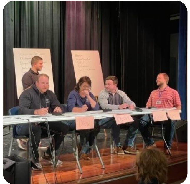
Lockshield Partners Accounting staff competed in an Academic Bowl fundraiser for the local high school academic teams, sponsored by Kiwanis.