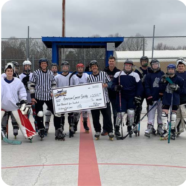
Warren County Inline Hockey League (WCIHL) raised money this year for the American Cancer Society with their "WCIHockey Fights Cancer" event.