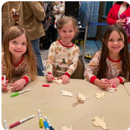
The Cassidy girls decorating some ornaments for their tree.