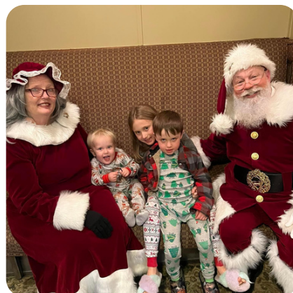
Santa and Mrs. Claus made it all the way from the North Pole!