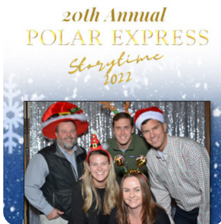
The Lockshield team enjoying the Photo Booth.