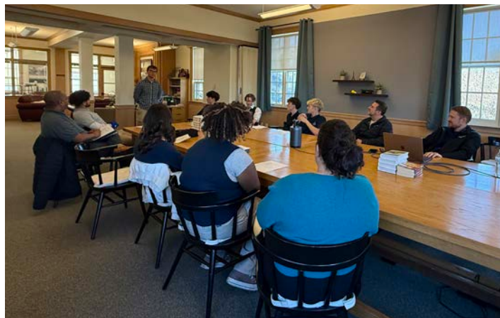
Campus Ministries leading office worship at NNEC

In the book Education (p.296), Ellen White says that “Something better” is the watchword of education, the law of all true living.” As believers, we know that Jesus always offers us something better than what this world can offer. It thrills my heart to witness the spiritual growth that our students are experiencing daily at Pine Tree Academy. It is foundational that the faculty are comprised of praying, dedicated, and mission minded individuals. A part of that foundation is academic and extra-curricular excellence. But I believe that “something better” is happening at Pine Tree Academy. The students, including the Student Association leaders, have made the conscience decision to prioritize their faith and exercise that faith at school. I notice it when I spend time there. The presence of the Holy Spirit is undeniable. How they facilitated this is worth noting.