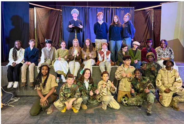
The Visual Presentation students