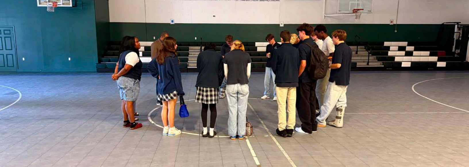
Morning Prayer Group