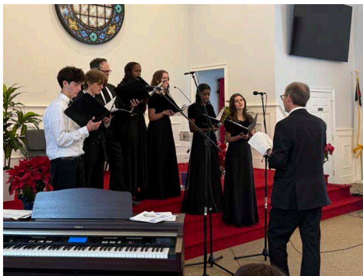
PTA Select Choir at Woodstock Church

Starting at the top, the faculty and students have committed themselves to modeling a lifestyle