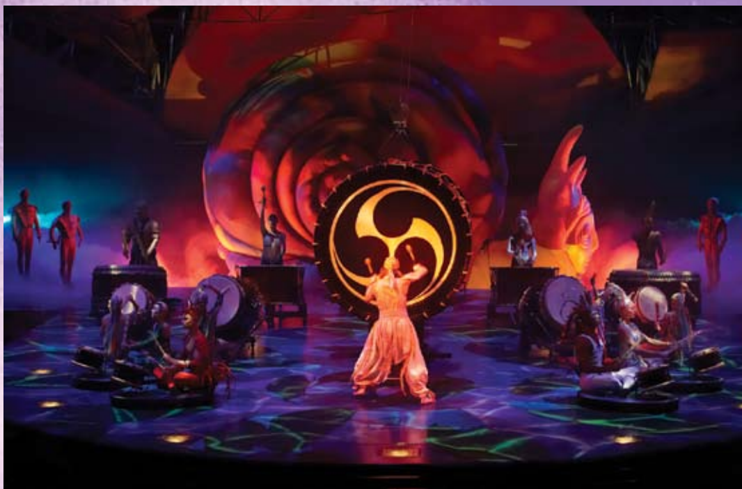
COSTUME: DOMINIQUE LEMIEUX.

Variations are created in the moment according to the artist's needs.